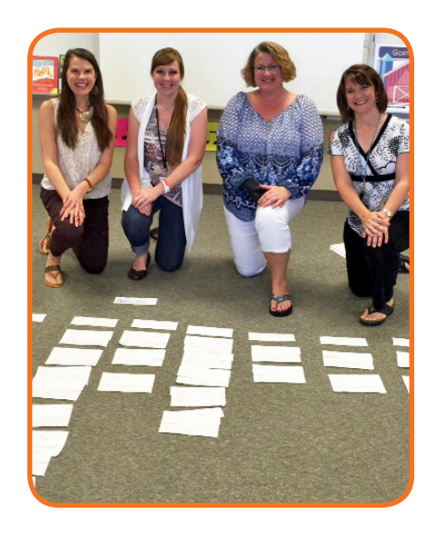
Teachers using Thinking Maps at Friendship Elementary School

But the biggest change he sees is in the quality of conversations he is having with his teachers. "When we get together, we're having discussions that we wouldn't have had without this tool," he says. "It's not just discussing how to use the Maps. We have deep conversations about teaching and learning. TMLC is a springboard for more intentional staff development and a frame to talk about deeper issues in our school."