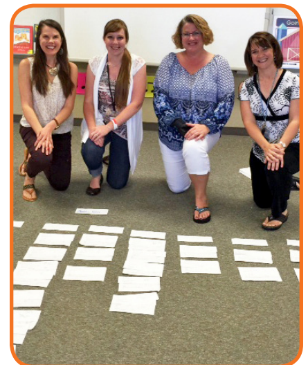
Teachers using Thinking Maps at Friendship Elementary School

But the biggest change he sees is in the quality of conversations he is having with his teachers. “When we get together, we’re having discussions that we wouldn’t have had without this tool,” he says. “It’s not just discussing how to use the Maps. We have deep conversations about teaching and learning. TMLC is a springboard for more intentional staff development and a frame to talk about deeper issues in our school.”